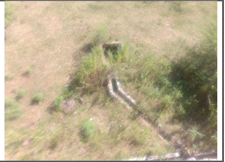
Arial View – Front Site 21°30'30.2"N 81°28'55.6"E